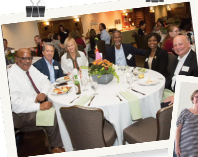
Thank you to our generous donors for joining us at the Moorestown Community House for the 2024 Donor Impact Dinner!

Thank you to our compassionate employees, donors and volunteers for your dedication and commitment to our mission throughout the year.