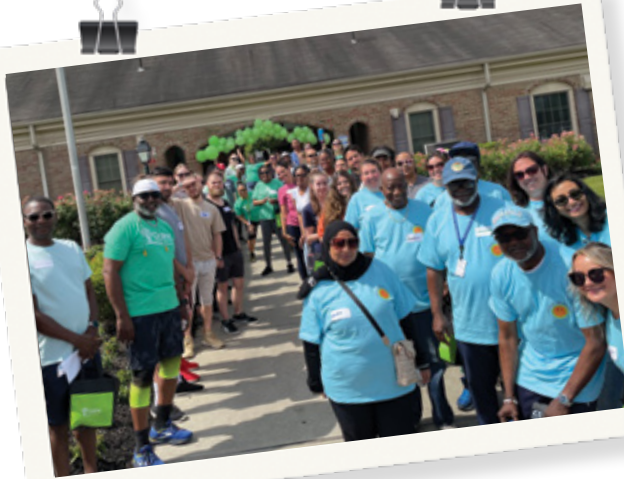
Over 160 team members and health vendors took part in our Employee Wellness Fair and 5K Walk Run.