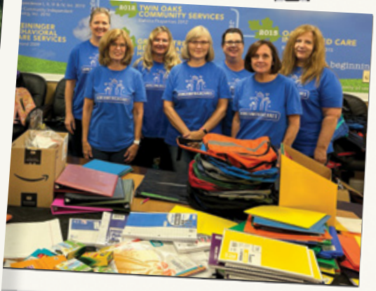
Thank you One America for volunteering your time to sort and stuff donations for Operation Fill-A-Backpack!