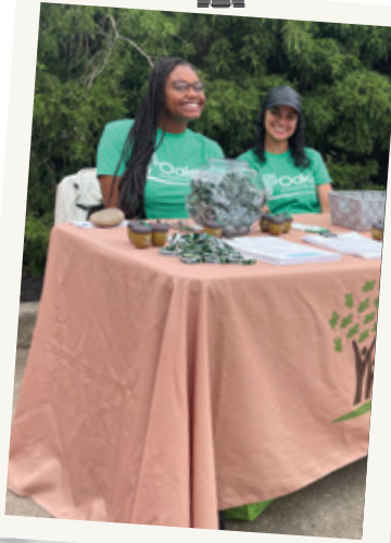
Team Oaks participated in the Annual Addiction Awareness Night at the Trenton Thunder baseball game!